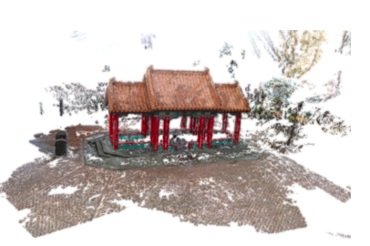
(c) Seed model added by a playerl

These mechanics result in a virtual world, populated by 3D reconstructions, which grows organically through continued player interaction.