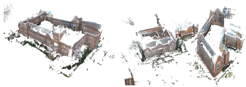
(a) Circumnavigated building