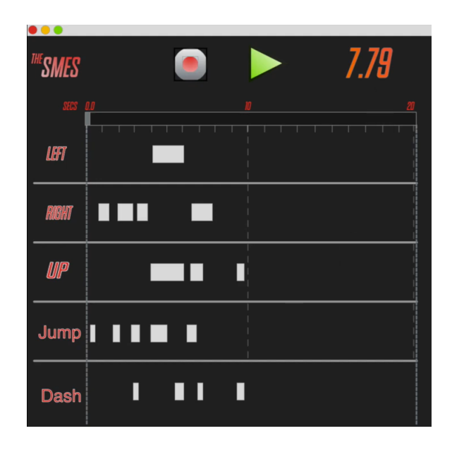
Figure 3: The visual mock-up of the editor. The prototype GUI is actively in development.

Due to the game not running in an emulator and the Win32 API not being instantaneous the playtrace that is replayed is not completely deterministic. In our experiments there is an 2% average divergence between the length of the input sequence and its realized replay. Because the errors compound in a playtrace this can result in perceivable differences